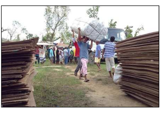
1, 950 sheets of Lawanit 4' x 8' plyboard were delivered to Sara town residents.