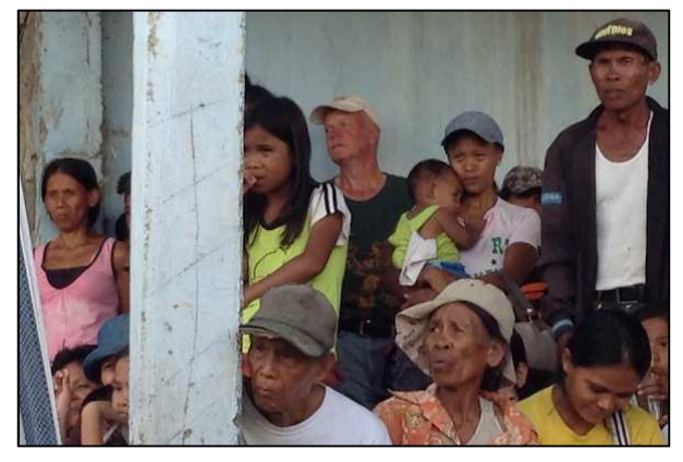
The residents and recipients of the construction materials