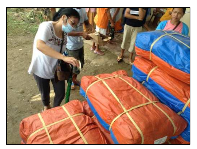
1,500 sleeping mats were donated by Borland Development Corporation.