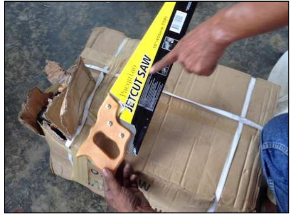
Above are some of the building materials and tools provided for those who will be rebuilding their houses.